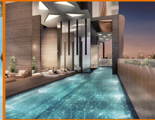
4 - Bedroom Penthouse