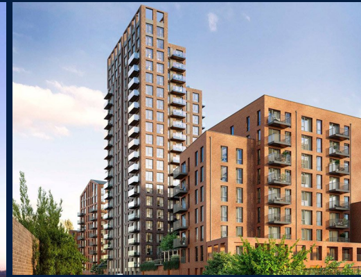
The Regent : 1 - Bedroom