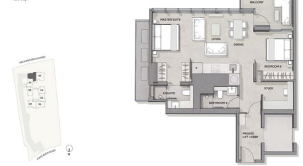
TYPE D1 926sqft