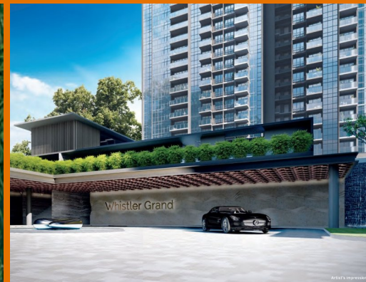
2 - Bedroom Premium + Study