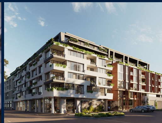
Stanley : 3 - Bedroom