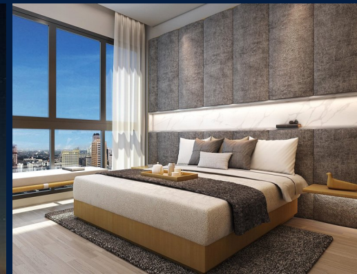
Penthouse + Dual Key