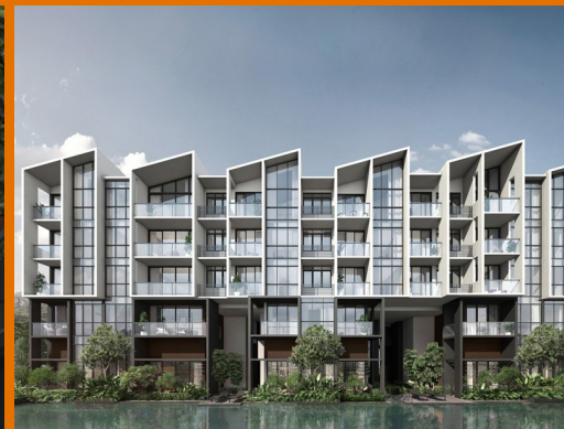
2 - Bedroom Premium

TYPE B3 #03-07, #04-07, #03-13, #04-13 #03-03, #04-03 (mirror) #03-17, #04-17 (mirror) 68 sq m / 732 sq ft