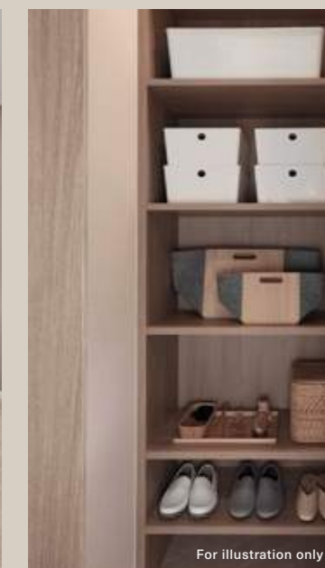
For illustration only