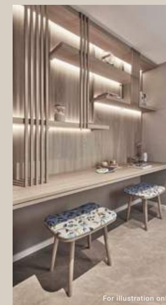
For illustration only

Never overlooking the little details, the Signature Series units feature premium finishes such as porcelain tile flooring as well as fittings from Bosch and Samsung for the kitchen, Laufen and Hansgrohe for the bath.