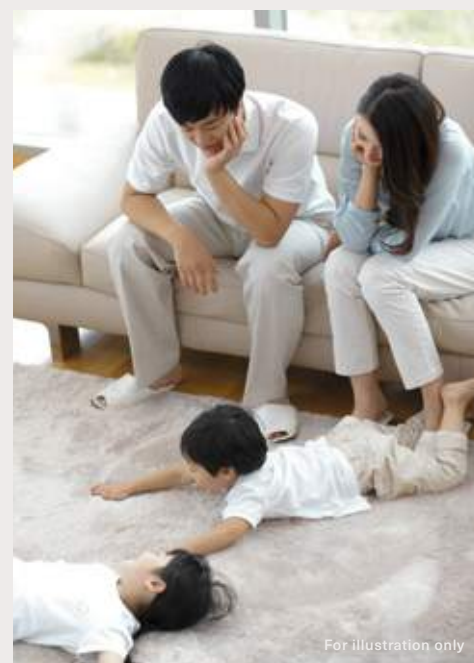
For illustration only

Green as well as smart, every apartment at Ki Residences comes with a host of smart home technologies that lets you control key features like the air conditioner and front door access via your smartphone wherever you are, creating even greater peace of mind.