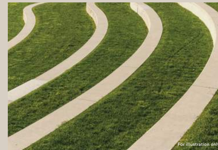
For illustration only

Soothe both mind and body at the Hydrotherapy Shower and Steam Room overlooking the tranquil Rock Pool.