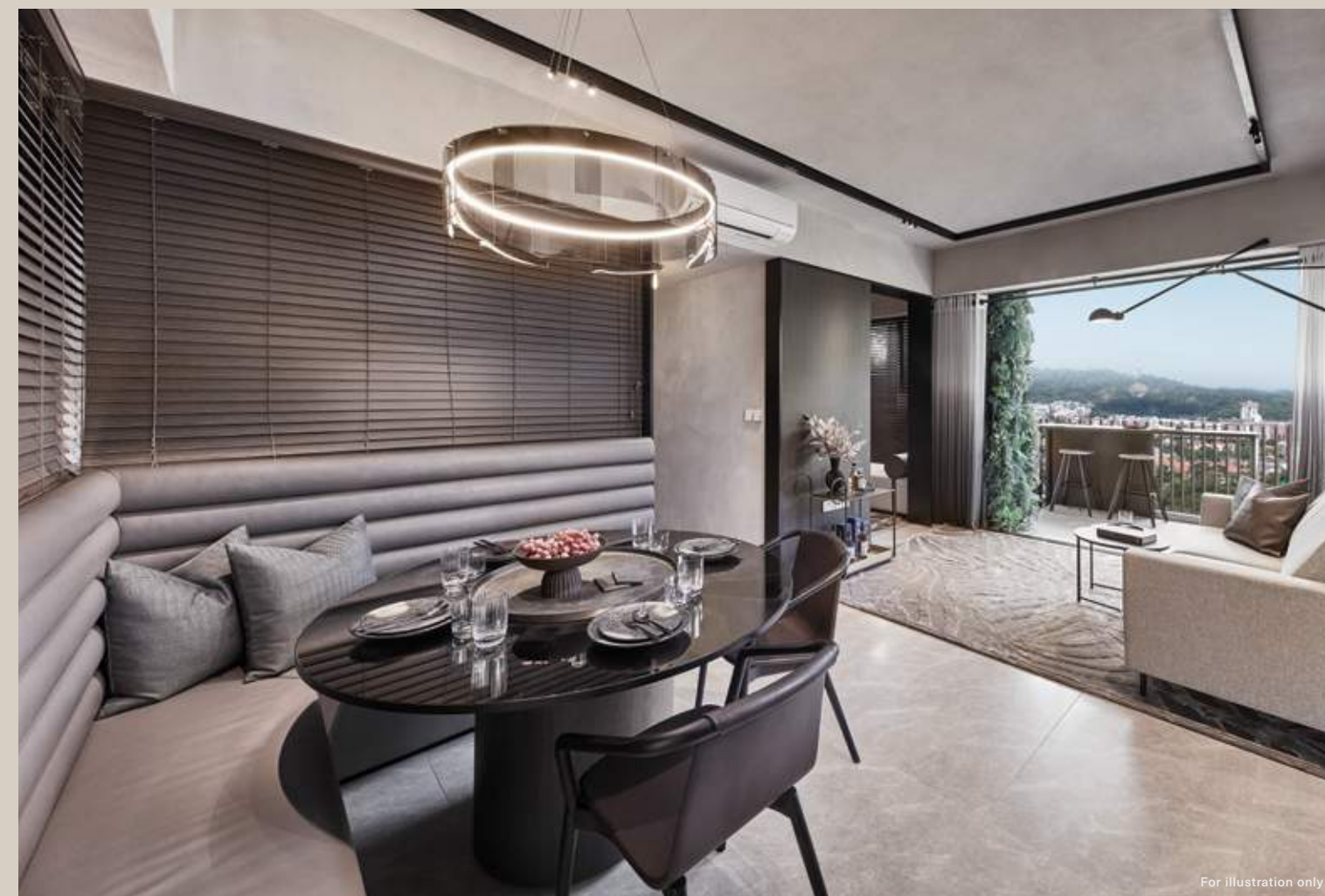
For illustration only

Whether you're a couple just starting on your life journey or a young family, here is a home that makes room for you. Thoughtful layouts let you utilise every inch while clever storage solutions keep clutter at bay, including a good-sized storeroom.