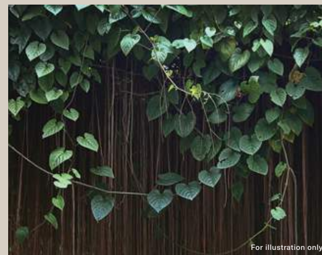
For illustration only

With its terraced steps built into the undulating terrain, the Lawn Amphitheatre invites you to take a seat.