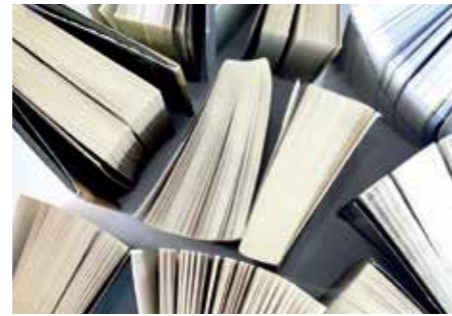
Singapore Chinese Girls' School, Anglo-Chinese School, River Valley Primary School and Chatsworth International School.