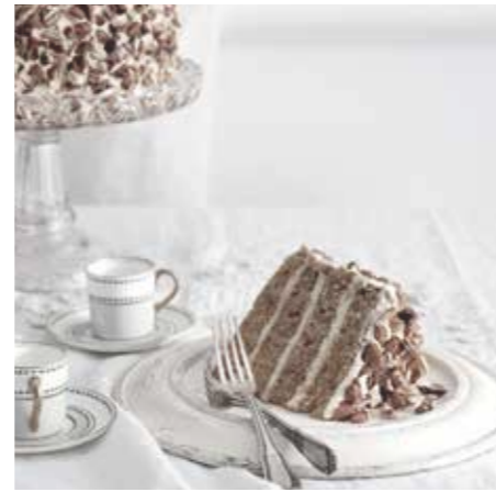
Artisan cafés at your doorstep.