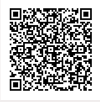
Scan QR Code